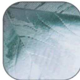
Sycamore - 2