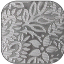
Chantilly - 2