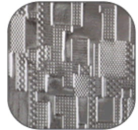
Digital - 3