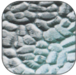
Arctic - 4

please notice that next to each name there is a privacy level rated from 1 to 5, with 1 being the least obscuration and 5 being the greatest.