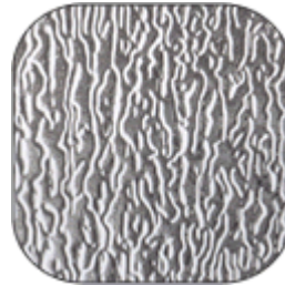
Contora - 4