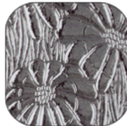
Mayflower - 4