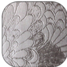
Pelerine - 5