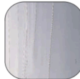
Warwick - 1

Due to the manufacturing process, the pattern of Warwick is completely random and no two pieces are the same.