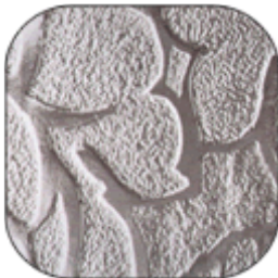
Florielle - 4