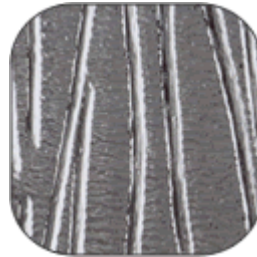
Charcoal Sticks - 4