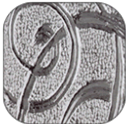
Everglade - 5