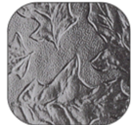
Oak - 4