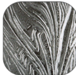
Taffeta - 3